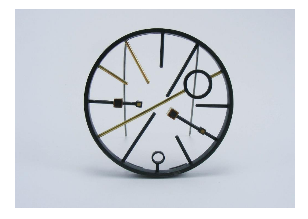
Catherine Rua, Like Clockwork Brooch , 2018, Sterling Silver, 9ct gold, Stainless Steel Brooch Pin, 6.2cm diameter, £1,195

7 SEPTEMBER – 29 NOVEMBER 2018 PRESS & BUYERS EVENING, INVITE ONLY, WED 17 OCTOBER, 5 – 8 PM ATRIUM, THE GOLDSMITHS' CENTRE ADMISSION FREE